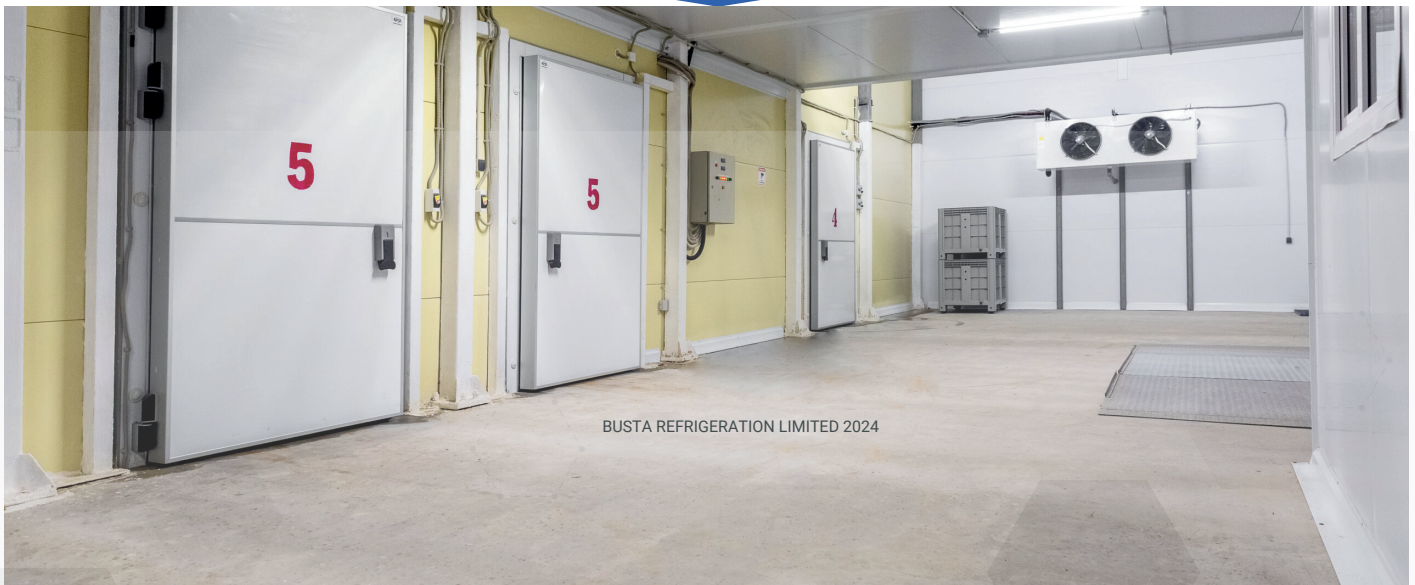
BUSTA REFRIGERATION LIMITED 2024

Busta Refrigeration Limited is one of the leading manufacturers of cold rooms and offers attractive solutions to preserve products safely and hygienically.