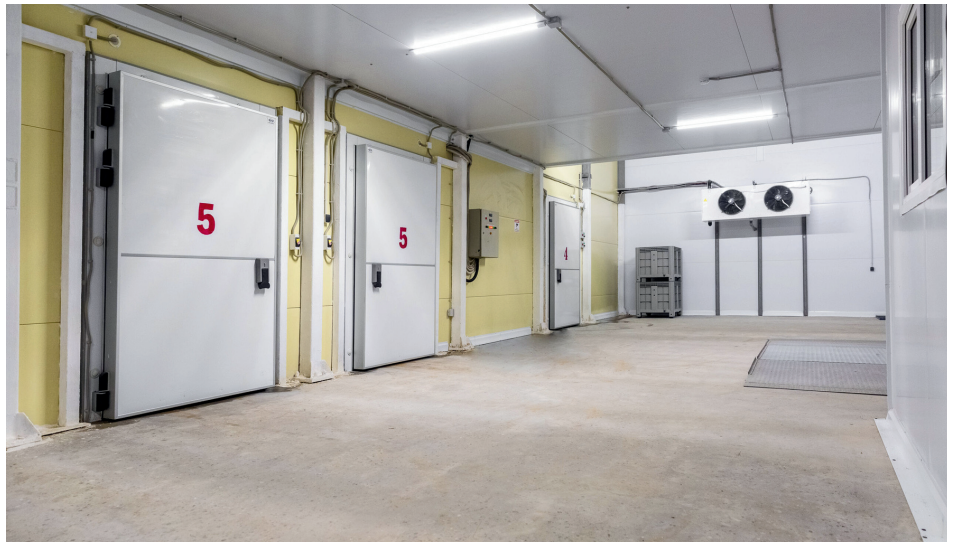
COMPLETED COLD ROOM