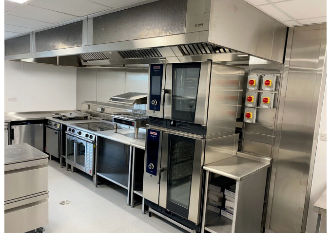
COMMERCIAL KITCHEN FITTING