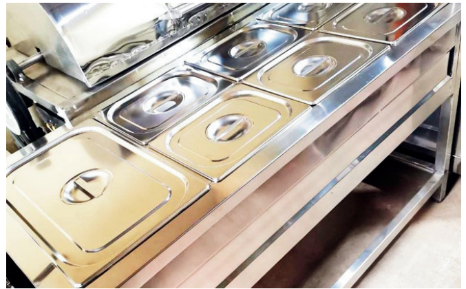
COMMERCIAL FOOD WARMERS