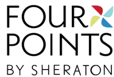
SHERATON HOTEL NAIROBI