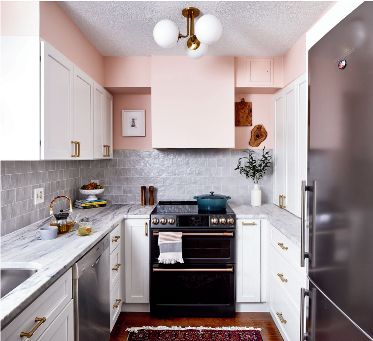
HOME KITCHEN FITTING