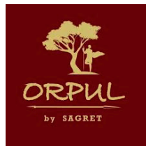
ORPUL BY SARGET