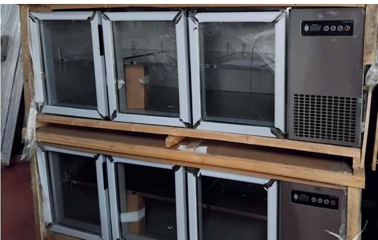
UNDER COUNTER CHILLERS