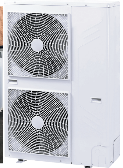
VRS OUTDOOR UNIT