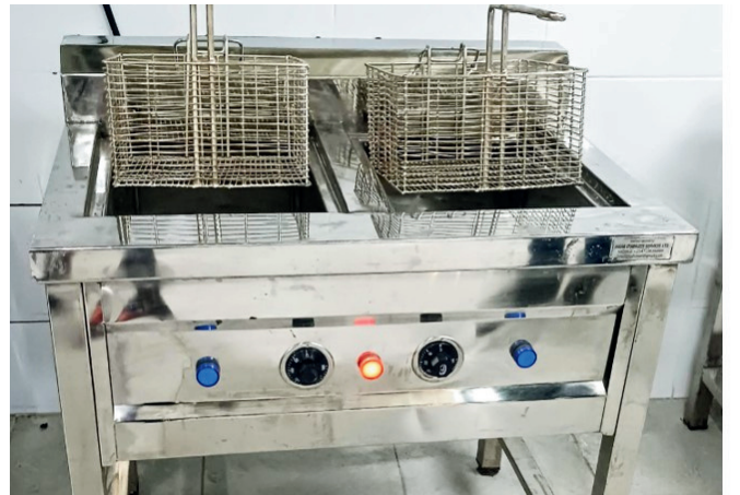
DOUBLE TANK DEEP FRYER