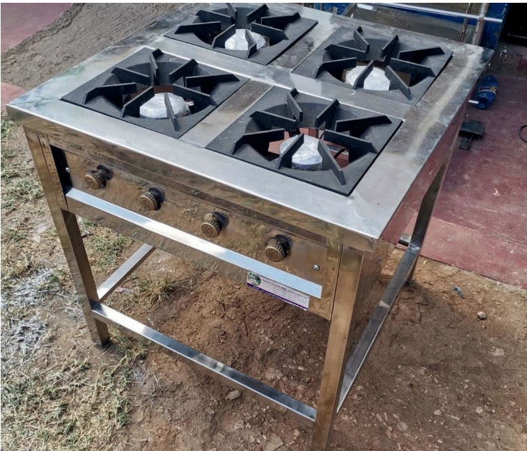
FOUR-BURNER COMMERCIAL GAS STOVE