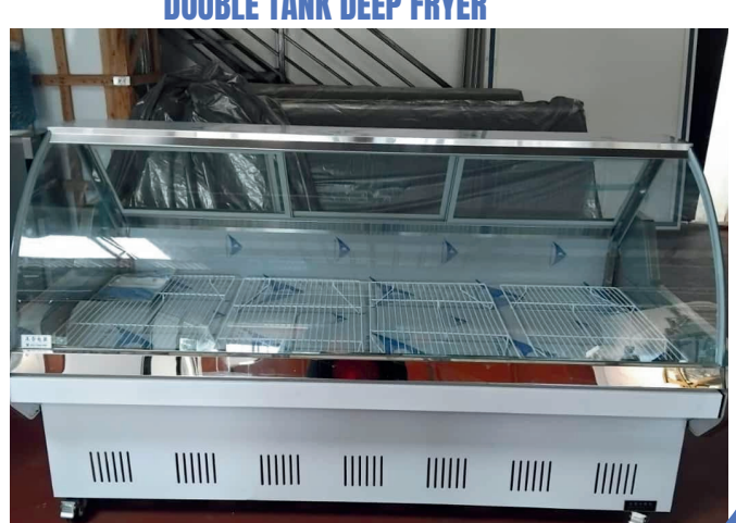
MEAT DISPLAY UNIT