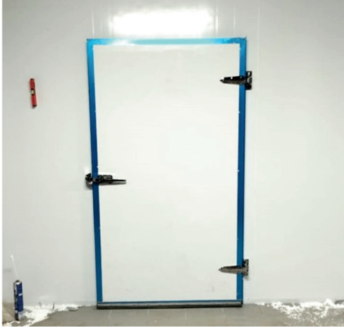
COLD ROOM DOOR