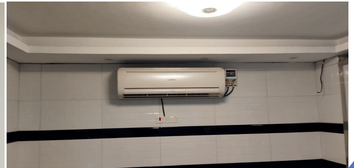
AIR CONDITIONING SYSTEM